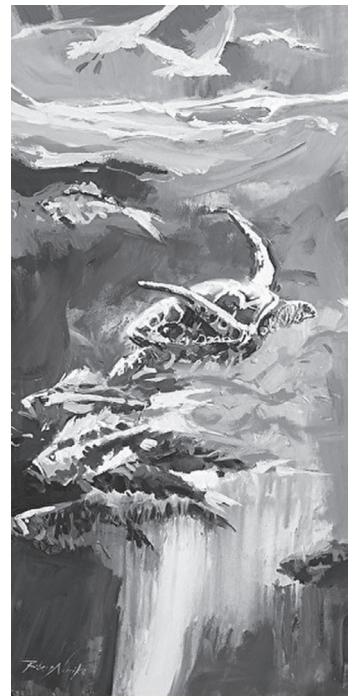
Blue Ascension, Acrylic